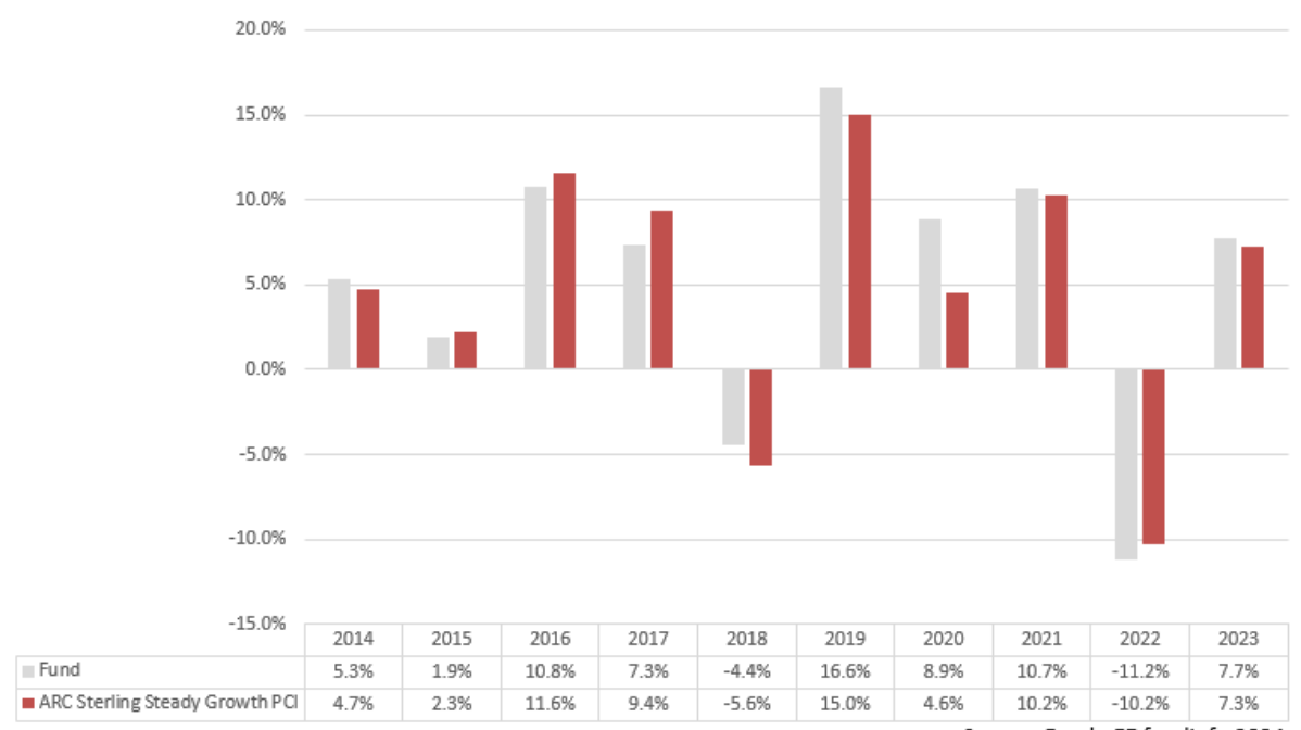
Appendix 3 Historical Performance Data